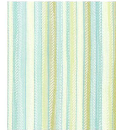
BLOX Lime Twist