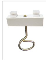
IV Tree Carrier 10498 White