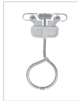
Self Locking IV Trolley 10499 Silver