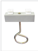
IV Tree Carrier 10497 Silver